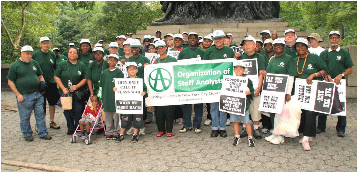
OSA members at the Labor Day Parade, holding signs that read "They Only Call It Class War When We Fight Back" and "Tax the Rich, Not Our Future!"

Public sector workers and our unions have been under severe attack in recent years by corporate interests and the politicians who carry their water. They would diminish our rights and decrease our benefits. They foster a view of the public sector that undermines our dignity and dismisses our contribution to American society.