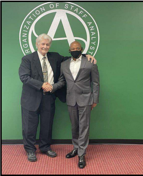
Brooklyn Borough President and Democratic Mayoral nominee Eric Adams at the OSA office during the 2021 primary.