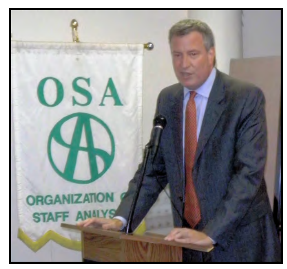
Soon-to-be Mayor Bill DeBlasio in 2012..