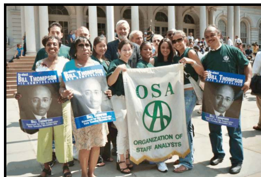
OSA endorses City Comptroller Bill Thompson for re-election in 2005 in front of City Hall.