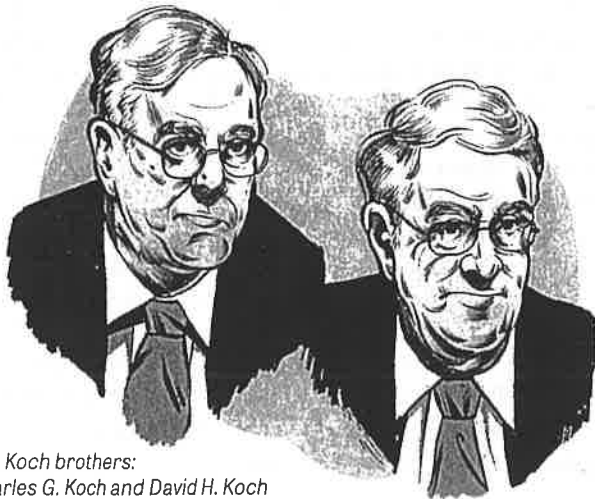
The Koch brothers: Charles G. Koch and David H. Koch

Illinois Gov. Bruce Rauner. Rauner issued an executive order in 2015 instructing Illinois to stop collecting fair share fees. At the same time, he filed a federal lawsuit to speed the issue to the U.S. Supreme Court. Two SPN member groups—the Illinois Policy Institute and the National Right to Work Legal Defense Foundation—joined the suit with plaintiff Mark Janus, who makes a much more sympathetic poster child than a billionaire venture capitalist. When Rauner was found not to have standing, Janus was allowed to pursue the suit.